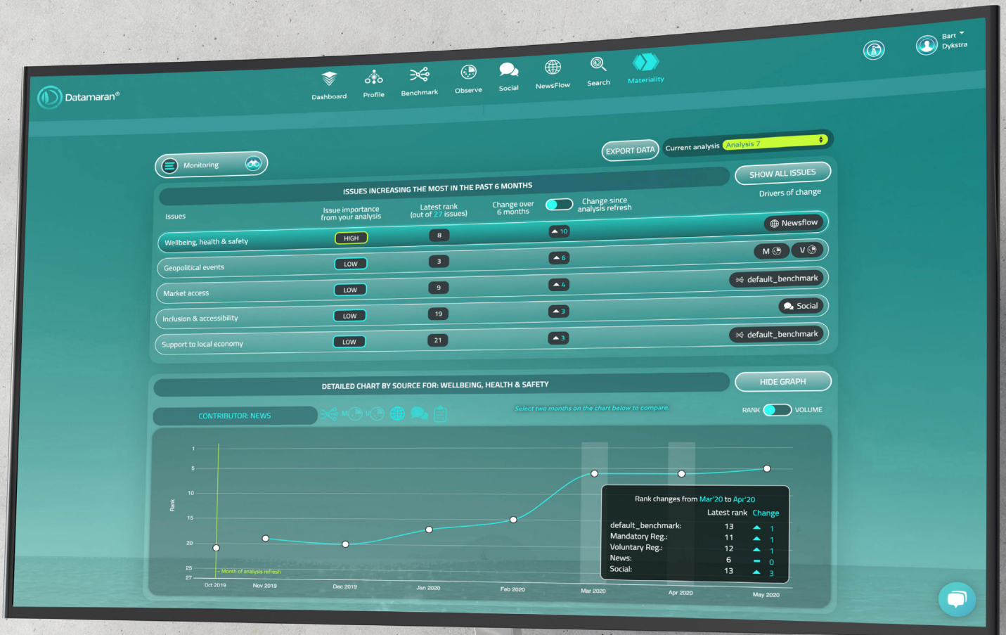
View of Datamaran's intuitive dynamic topic ontology library and issues Monitoring feature.